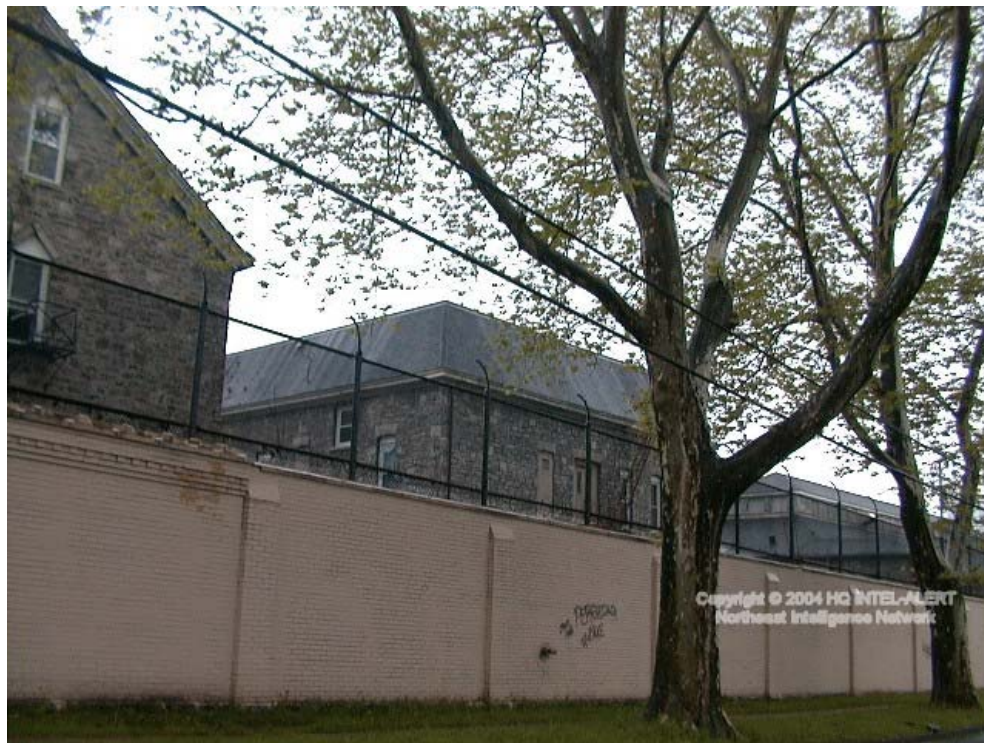
Side of compound 15 May 2004