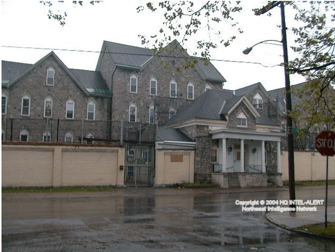
Islamic Training Facility: 485 Best Street, Buffalo, NY

--Buffalo Common Council Member Charley Fisher